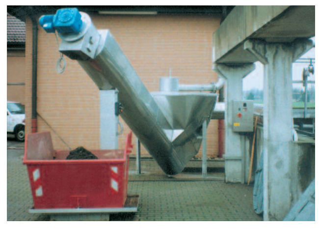
HUBER Coanda Grit Classifier RoSF3 installed subsequent to a grit channel