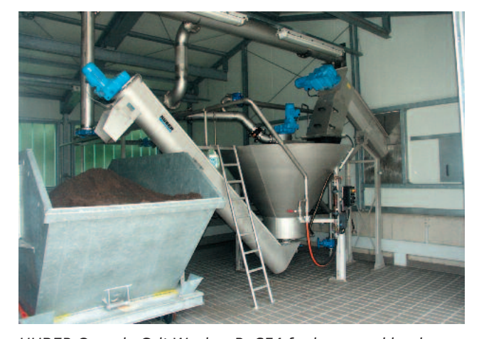
HUBER Coanda Grit Washer RoSF4 for improved hygiene and reduction of disposal costs