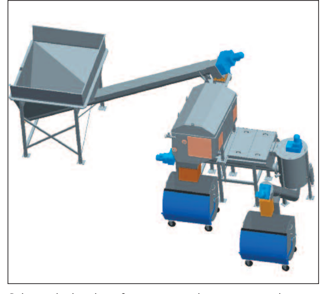
Schematic drawing of a compact grit treatment unit