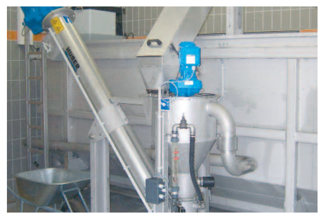
Small HUBER Grit Washer RosF4 TC washing classified grit from a HUBER Complete Plant ROTAMAT® Ro5