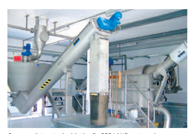
Sewer grit treated with the RoSF5 VWS system is recycling material.