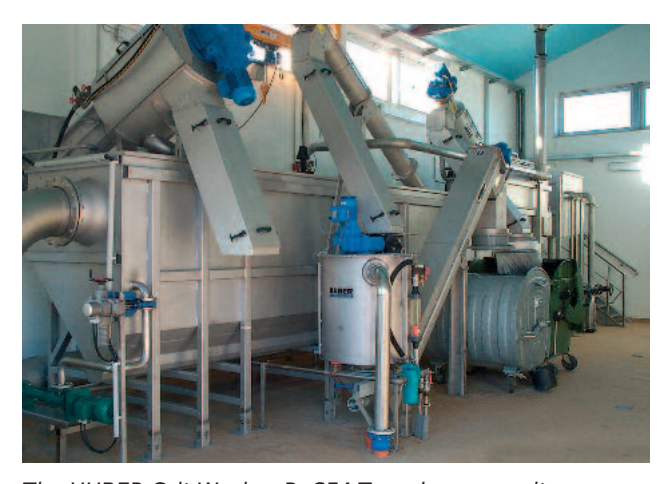
The HUBER Grit Washer RoSF4 T washes any grit