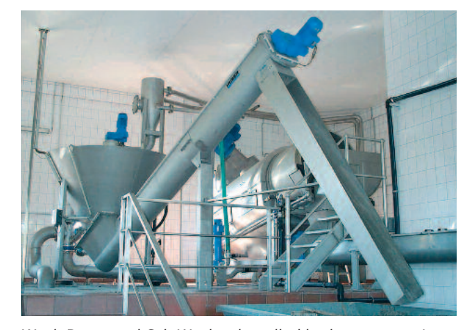
Wash Drum and Grit Washer installed in the customer's building