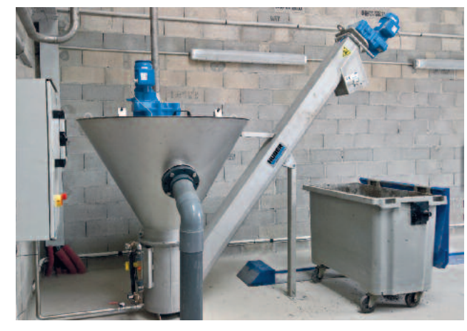
HUBER Grit Washer RoSF G4E