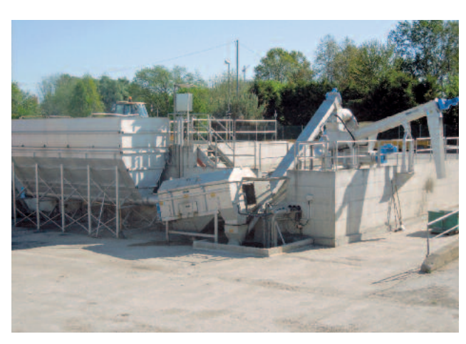
Acceptance tank for above-ground or underground installation