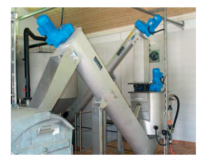
The HUBER Grit Washer RoSF4 T washes the classified grit from a HUBER Circular Grit Trap HRSF