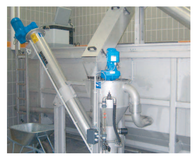
A small HUBER Grit Washer RoSF4 TC washing the classified grit from a HUBER Complete Plant ROTAMAT® Ro5