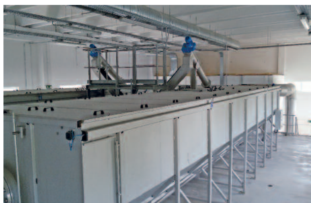
Above-ground redundant installation of a HUBER Longitudinal Grit Trap ROTAMAT® Ro6

Separation of fats and grease is only available when used with aerated grit channels. The grease is collected in a separate chamber with the partition between the grit trap chamber and grease chamber consisting of a slotted scum board. The flow generated within the grit trap chamber by the aeration system transports the grease through the slotted scum board into the grease chamber.